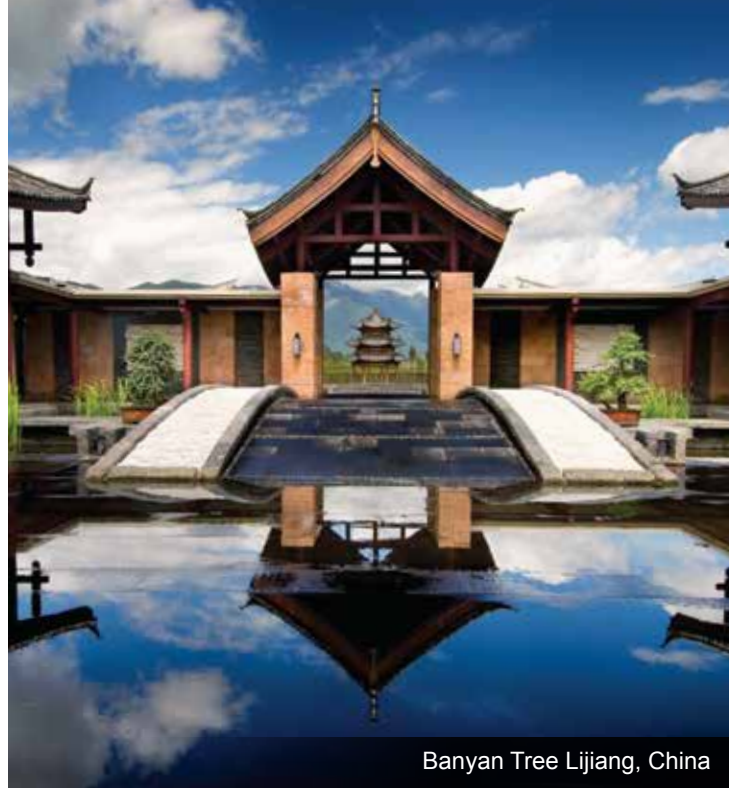
Banyan Tree Lijiang, China