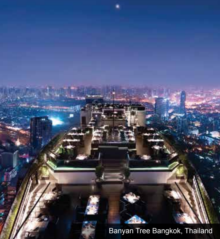
Banyan Tree Bangkok, Thailand