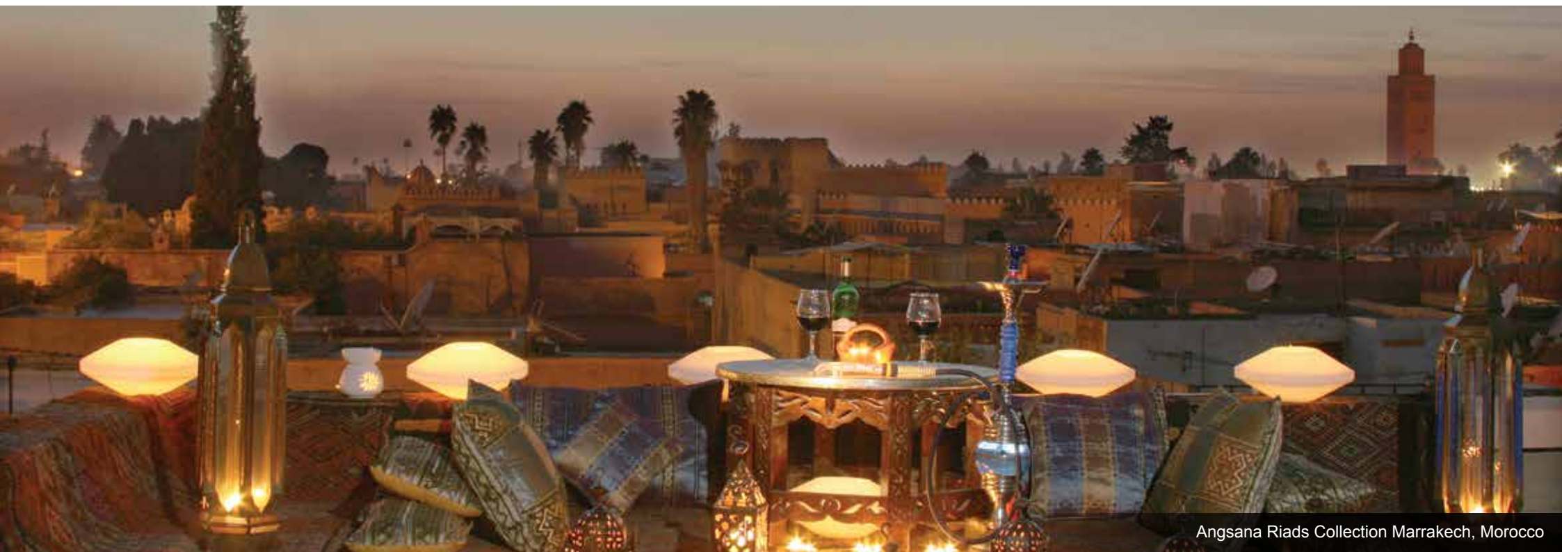
Angsana Riads Collection Marrakech, Morocco